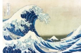
Katsushika Hokusai "Thirty-six Views of Mt. Fuji: Great Wave off the Coast of Kanagawa"