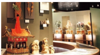
Shinto Permanent Exhibition