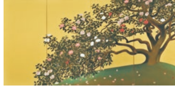
Hayami Gyoshu, Camellia Petals Scattering [Important Cultural Property]: Yamatane Museum of Art