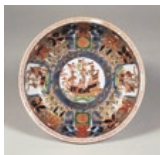
Bowl, decorated with five ships and European figures design in underglaze blue, overglaze enamels and gold. Imari ware.