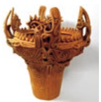
Deep pot (umataka type, flame-style pottery), Middle Jōmon period, ca. 3,000 B.C.E.