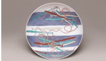
Dish, decorated with seventeen oars design in underglaze blue and overglaze enamels. Nabeshima ware.