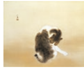
Takeuchi Seihō, Tabby Cat [Important Cultural Property]: Yamatane Museum of Art