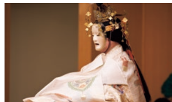
Noh "HAGOROMO" performed by YOSHITO SEKINE at Cerulean Tower Noh Theatre from the 2008 performance