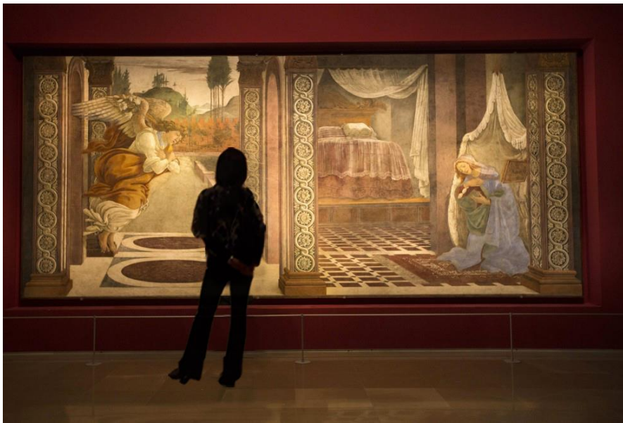
Sandro Botticelli Annunciation 1481, Florence, Galleria degli Uffizi

This exhibition will highlight the banking and financial business that dominated the trade and business throughout all of Europe while working as the prime mover of the Renaissance, and it will also highlight the birth of modern activities of mécénat. Approximately 80 items will be displayed, consisting mainly of Botticelli's masterpieces as well as paintings, sculptures and engravings created by distinguished artists of the Renaissance period, including books and materials that tell of the historical background.