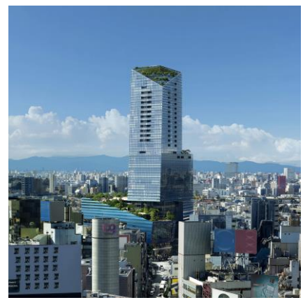
▲ Exterior